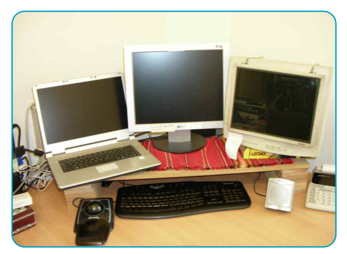
Figure 2 – One PC with two monitors plus one laptop

The same program, MaxiVista, will let you access the desktop of a second PC (connected through a network)