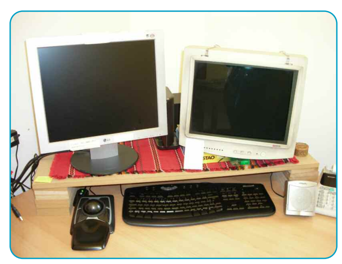
Figure 1 - Two monitors on one PC

In this issue, my tip is related to hardware. The last time I purchased a new desktop computer, I noticed that there was an option to purchase a video card with two input connectors, which would allow me to attach two monitors to my PC. I had two monitors in my office, but the smaller, older one was in the closet. I took it out, dusted it off, and voilà! The result can be seen in Figure 1. For those of you not familiar with this kind of setup, the second screen is not a copy of the first, but rather an extension of it. The mouse pointer glides continuously from one screen to the other, and you can drag things